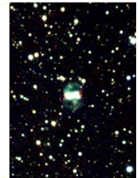
M76 [30 minutes stacking]

The latest images from the Society's SeeStar S50. The planetary nebula M76 – the Lesser Dumbbell Nebula, the smaller brother of M27 Dumbbell Nebula.