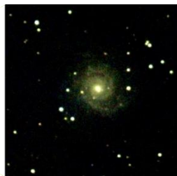
M74 [40 minutes stacking]